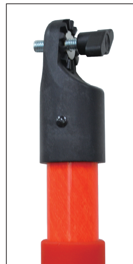
Universal Sunrise Fitting head