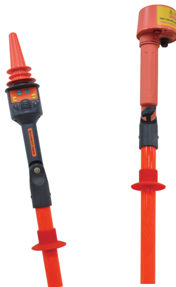
Attached to the High Voltage Proximity Detectors and Contact Capacitive Detectors