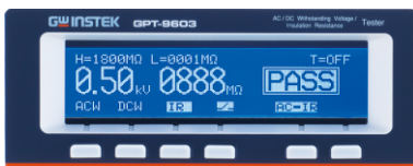
Large LCD, High Intensity Indicators and Function Keys

The 240 x 48 display clearly shows the applied voltage, test parameters, test conditions, measurement value and result on the screen at the same time. The real-time status update on the LCD display accompanied by the multi-colored LED status indicators on the front panel allow operators to have a full control of the test process to perform precision test and avoid unnecessary operation risks at the same time. The status indicator above the high voltage output terminal will automatically flash when an output is in place. In addition, the function keys arranged below the LCD display provide convenient operation that test functions can be easily changed by a single pressing.